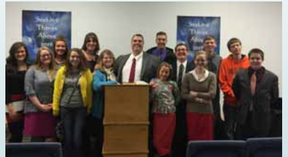
Kids from our youth group made a visit to our new church.