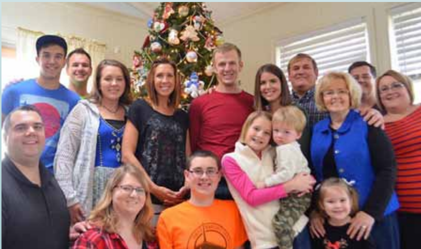
Every year we have a big family get-together at Christmas.